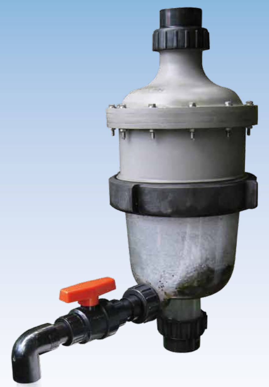
Cleansed with only 15 litres of water.