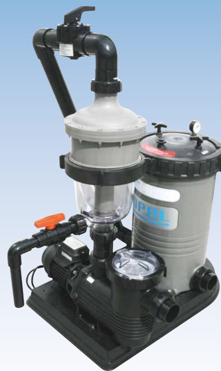
Captures 80% of the dirt load.