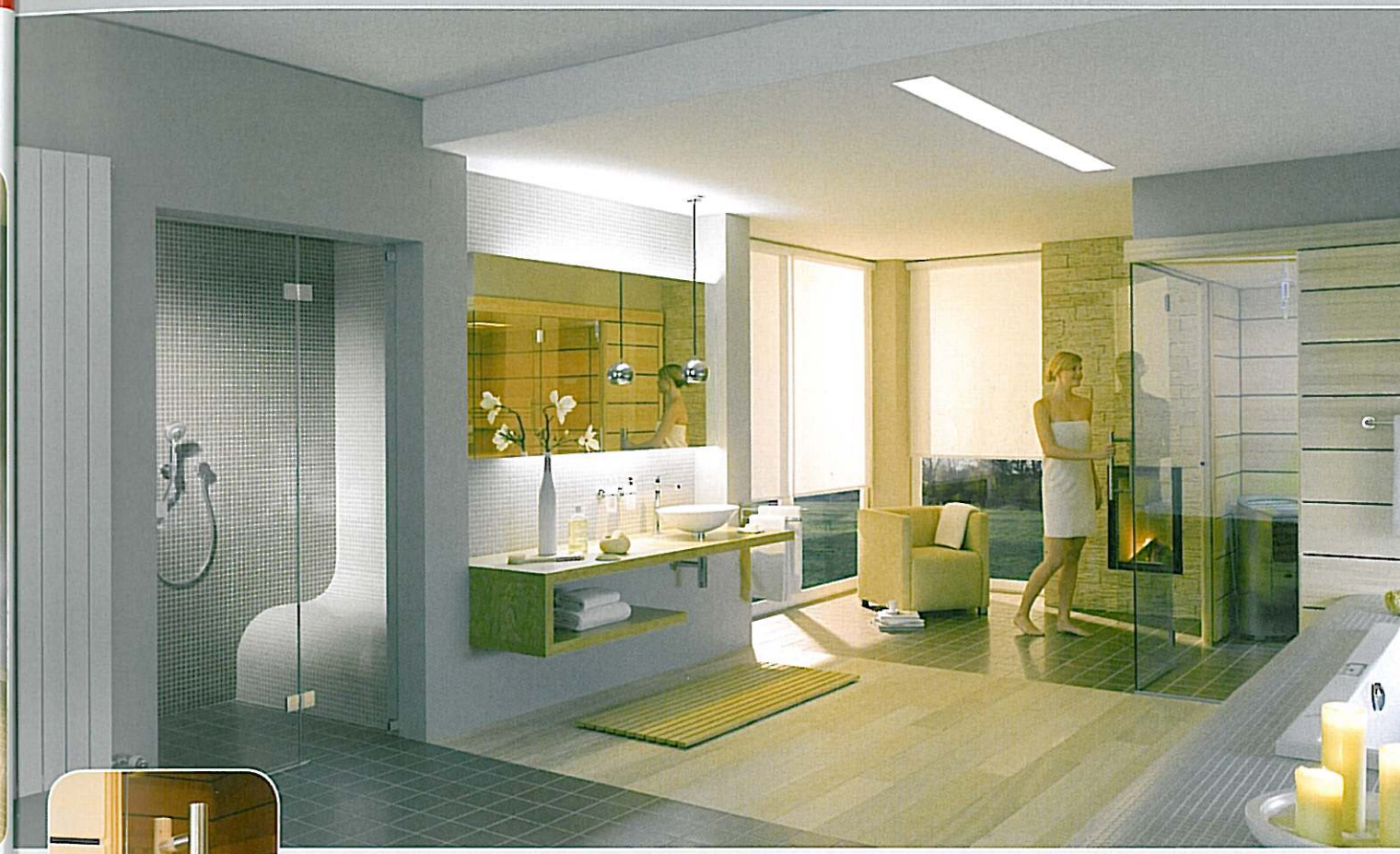
High quality panels in full wood, made of fir, with the softly rounded interior in aspen.